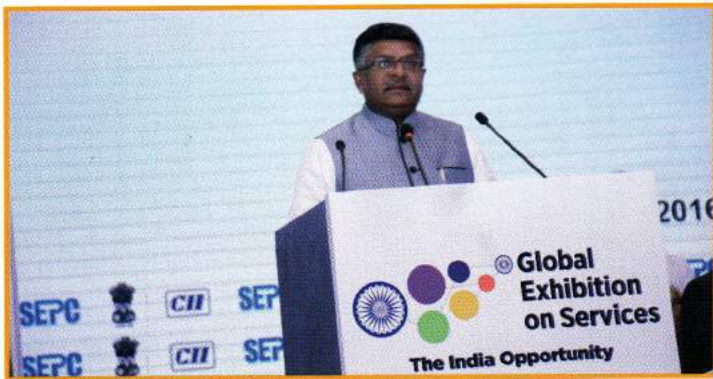
Sh. Ravi Shankar Prasad

Minister for Communications & Information Technology and Law & Justice, Government of India in GES 2016