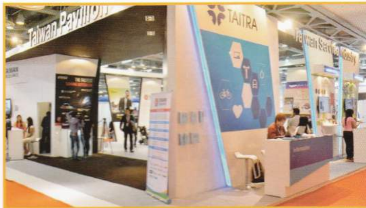
Exhibition Showcase in GES 2016