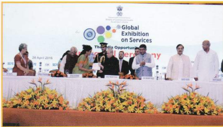
Inauguration of GES 2016 by Hon'ble President of India, Shri Pranab Mukherjee on 20 April, 2016