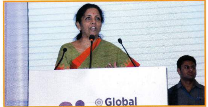
Smt. Nirmala Sitharaman

Minister for Communications & Information Technology and Law & Justice, Government of India in GES 2016